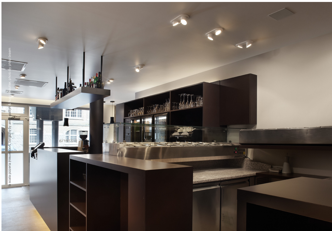
la scala pizzeria (nieuwpoort, belgium) by anis patry & rupp designer